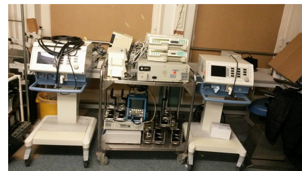
Donated medical equipment ready to embark to Greece

We know for a fact that together we are saving lives. Please help us save many more!