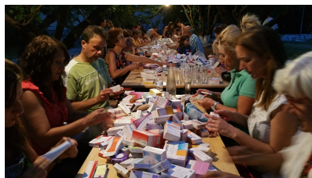
Volunteers checking the donated medicine

We will try to link up with as many organisations working in this area as we can. That's why we need your help.